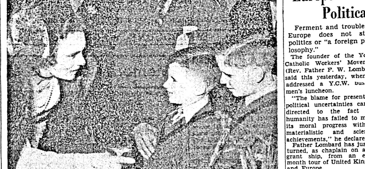
THE DUCHESS OF GLOUCESTER, who is president of the Fairbridge Society, talks with young Britons during a farewell party at Pinjarra, West Australia. The society's aim is to restore family life to orphans and deserted children.

Letters to the Editor. Backing Loans for Homes. Sir.—The proposal of the Premier to introduce a bill whereby the Premier Building Societies is definitely a step in the wrong direction.